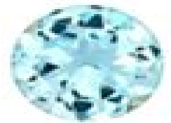
March Simulated Aquamarine