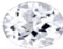
April Simulated Diamond