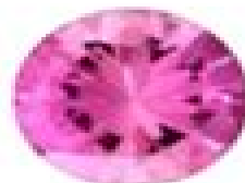
October Simulated Pink Tourmaline