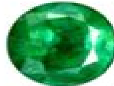
May Simulated Emerald