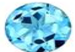
December Simulated Blue Topaz