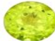
August Simulated Peridot