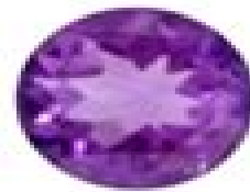
February Simulated Amethyst