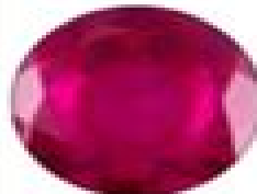
July Simulated Ruby