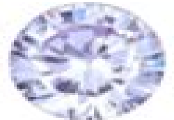
June Simulated Alexandrite