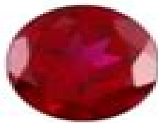
January Simulated Garnet