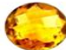
November Simulated Citrine