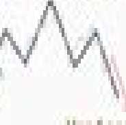
Head and Shoulders