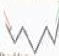
Cup and Handle