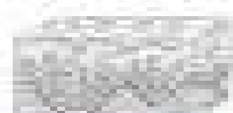
Simple Cuboidal Epithelium

Most abundant and most diverse type of tissue that covers internal and external surfaces.