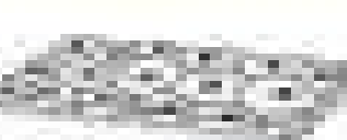
Simple Columnar Epithelium

What is the function of the epithelial tissue? (e.g., protection, secretion, absorption, etc.)