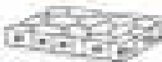
Simple Cuboidal Epithelium