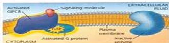
1 When the appropriate signaling molecule binds to the extracellular side

Describe what happens when a G-protein-coupled receptor is activated.