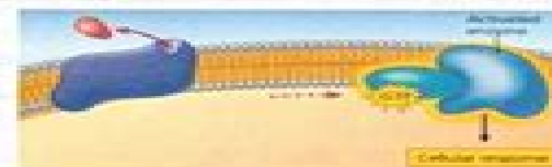
2 The activated G protein leaves the receptor, diffuses along the membrane, and then binds to an enzyme, altering the enzyme's shape and