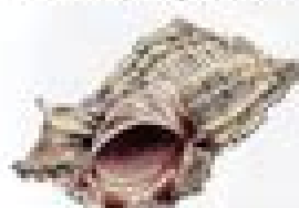
Carinate Downshell (W)

Chamaelea lamarckii To 2 in. (5.1 cm) Elaborate pinkish-white to brownish shell with long flaps.