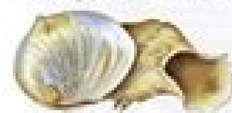
Solitary Glassy Bubble (V)

Conus californicus To 1.5 in. (3.8 cm) high Smooth brownish shell has a fine spine. A carnivorous species that preys on prey with a harpoon-like tooth that injects poison. Do not handle live specimens.