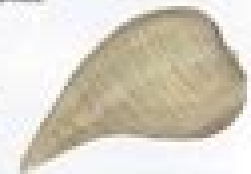
Common Fig Shell (CB)

Hydrobia ulitiformis To .75 in. (2 cm) Very fragile white to yellowish shell has a delicate lip. Shells are so light they are often transported to the highest tide line.