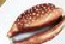
Atlantic Deer Cowrie (CB,CB)

Olivella septentrionalis To 2.5 in. (6.3 cm) Olive, yellow to grayish cylindrical shell has markings that resemble lettering. South Carolina's state shell.