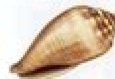
California Cone (CAS)

Conus septentrionalis To 3 in. (7.6 cm) Creamy shell has bands of red-brown splashes. Mouth is a long, dagger out of the narrow end of the shell.