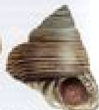
Ribbed Top Shell (W)

Hydrobia ulitiformis To 1 in. (2.5 cm) high Cone-shaped shell is black, to brownish-gray. Feeds on biofilms.