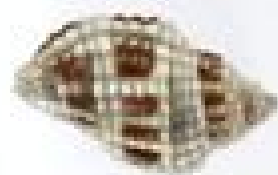
Circled Rocksnail (CAS)

Campelodiscus circumscriptus To 1 in. (2.5 cm) high White to grayish shell has prominent ridges and spiral bands with brown blotches. Feeds on biofilms.