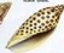
Johnstone's Junonia (CB, CB)

Nassarius trilineatus To 1 in. (2.5 cm) high Whitish shell has 4-6 beaded spiral ridges. Southern specimens often have 3 spiraling red brown lines.