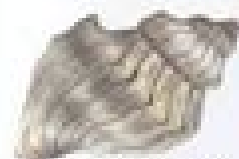
Frilled Dogwhelk (W)

Collusioidea ligatum To 1 in. (2.5 cm) high Pearl-like, strongly ridged shell is as wide as it is high.