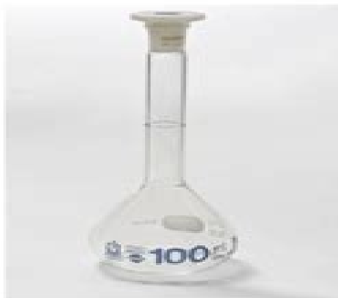
Volumetric Flask

In this laboratory exercise, we will calibrate the three types of glassware typically used by an analytical chemist; a volumetric flask, a volumetric pipet and a buret. Over the course of this semester, we will use these tools extensively when performing Gravimetric and Titrimetric Analyses. In order to avoid introducing Systematic Errors into our measurements, each of these instruments must be properly calibrated. And, to reduce the Random Errors inherent when using these instruments, their proper use must be thoroughly understood. The quality of the measurements obtained from these tools depends heavily on the care taken in calibrating and in using each instrument.