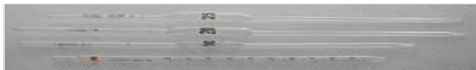
Pipettes ( http://www.chem.yorku.ca/courses/chem1000/equipment/pipette.html )